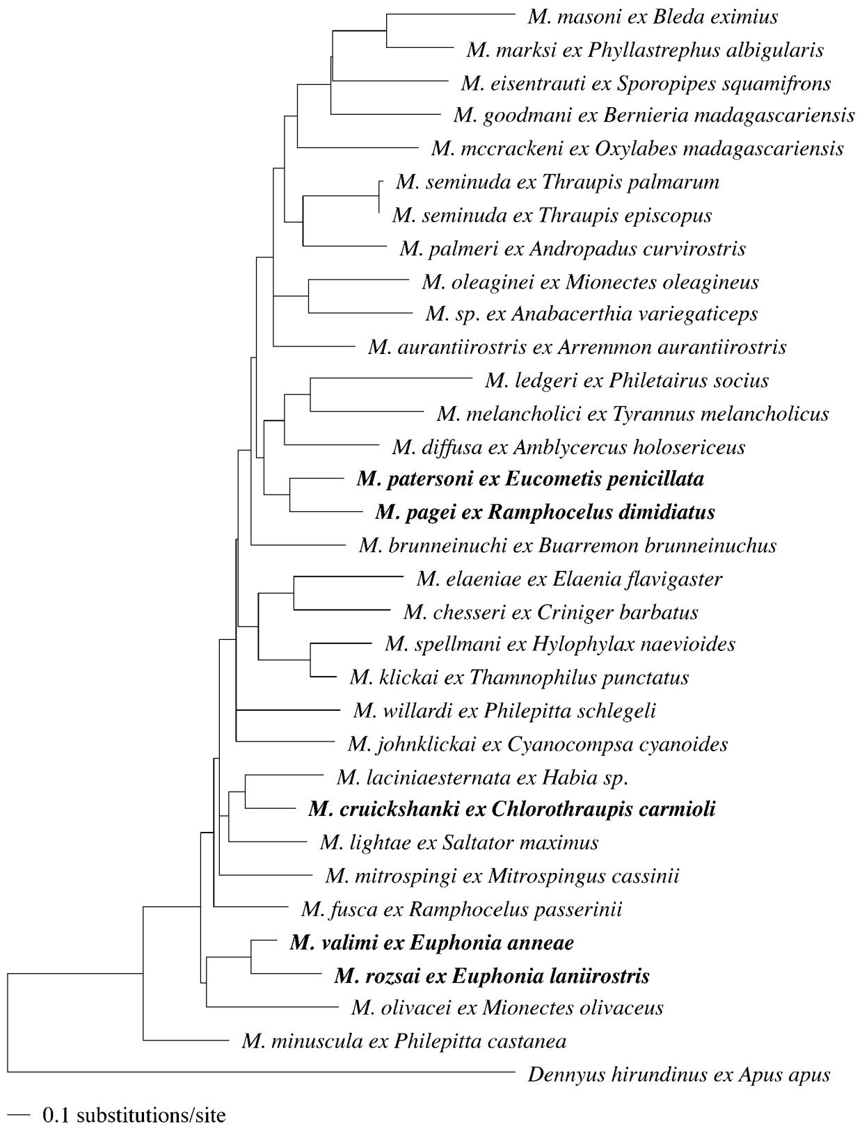
FIGURE 7. Phylogeny based on maximum likelihood analysis of 379 bp of the mitochondrial COI gene. Search involved 10 random addition replicates using a GTR+I+G model. Branches are proportional to substitutions per site (scale indicated). Bold names indicate species described in this study. M. = Myrsidea .

sac sclerite as in Fig. 6, broadly triangular with blunt rounded apical tip. Dimensions: TW, 0.36–0.39; HL & PW, 0.26–0.28; MW, 0.34–0.35; AWIV, 0.39–0.44; GL, 0.38–0.39; TL, 1.13–1.16.